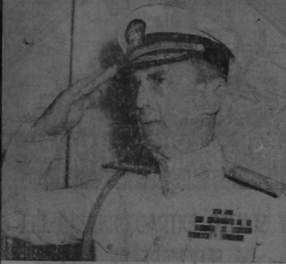
El Almirante de la Flota William D. Leahy.

Leahy dice que la fuerza combinada de los países libres hicieron posible la victoria