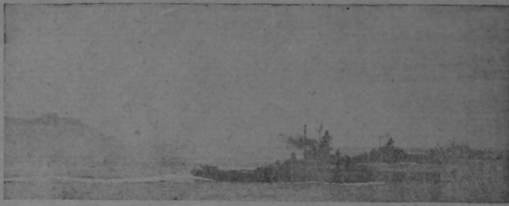
En audaz ataque contra las islas del Japón propiamente dicho una escuadra de los Estados Unidos arrojó miles de toneladas de acero sobre las industrias de guerra del Mikado. El bombardeo se ejecutó a la vista de las costas japonesas, que se ven a la izquierda de la foto, y constituyó un reto a la escuadra japonesa para que presentara combate, pero el reto no fue atendido.